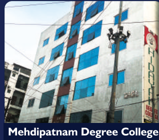
Mehdiapatnam Degree College